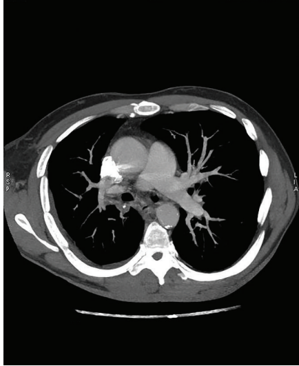
FIGURE 1: Multidetector computed tomography showed a PAPVC from the right upper lobe to the superior vena cava (arrow).