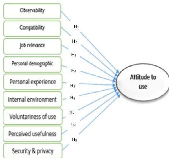
Figure 1: The proposed model of the study

hospitals of Shiraz University of Medical Sciences, the participants were selected through two-stage stratified sampling. In doing so, the first 7 hospitals were selected using simple random sampling. Then, some physicians in each hospital (a total of 200 physicians) were selected through simple random sampling.