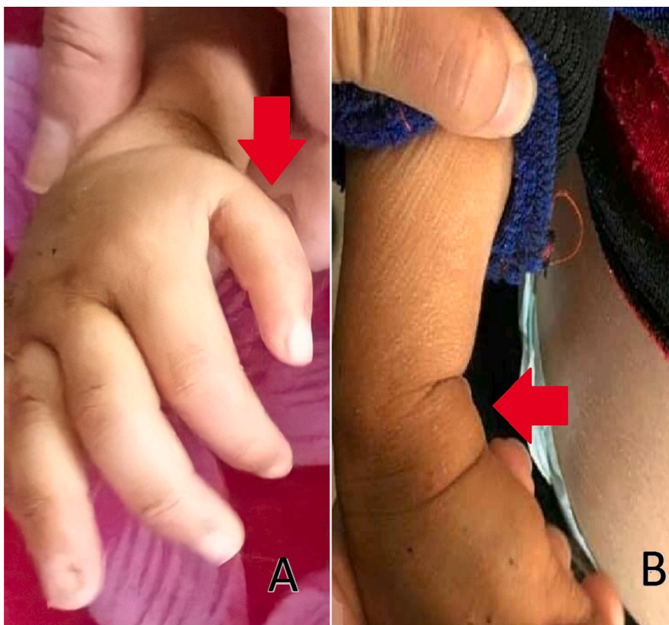
Fig. 1. (A) Distortion on the thumb of the right upper (Arrow). (B) Distortion on the left wrist (Arrow).