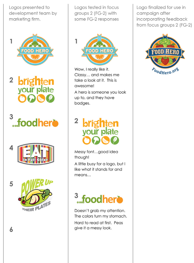
Figure 2. Process for the Design and Testing of Food Hero Logos (Focus Groups 2).

kits were designed to provide locally adaptable campaign tools and materials for OSU’s Extension county educators and their partners. The goal of the community kit was to assure that comprehensive educator/partner Food Hero promotion occurred concurrently with other campaign communication channels. Public relations efforts throughout the campaign included television and radio interviews, a family video makeover contest, and social media postings (i.e., YouTube and Facebook). The Food Hero social media project is described elsewhere [23]. Due to the time left in the project funding cycle, the campaign could only run for 2-months. Near the end of the campaign, a second PS was conducted to test for campaign awareness and FV beliefs, and to gain further insights for future campaign development (Step 7: PS-2; n = 802).