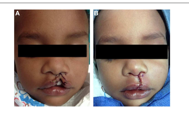
FIGURE 4 | Repair of left incomplete lip using modified Millard technique. (A) Preoperative photo, (B) status post repair.