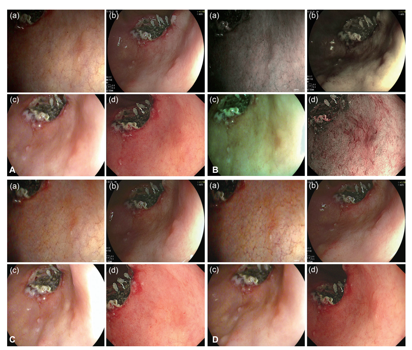
Fig. 2. Gastric lesion (in vivo) taken according to each endoscopy company analyzed on each point of evaluation, namely (A) definition, (B) boundary, (C) brightness, and (D) light and shade.

select 60 spectral images per 5 nm at visible wavelengths between 400 and 695 nm. 9,10 IMAGE 1 Storz Professional Image Enhancement Software (SPIES) is the newly developed color spectrum shifting technology from Karl Storz. SPIES SPEC-TRA allows for the recognition of the finest tissue structures. The bright red portions of the visible spectrum are filtered out and the remaining color portions are expanded, making it easier to differentiate between tissue types. The light/dark contrast is enhanced by obtaining luminance intensity data for each pixel and applying an algorithm that allows for the detailed observation of mucosal surface structures. SPIES CLARA, on the other hand, supports proper illumination in each part of the endoscopic image, allowing for a clear display of details in both the light and dark areas of the image. Finally, SPIES CHROMA intensifies the color contrast in the image; thus, clearly visible structure surfaces are given added empha-