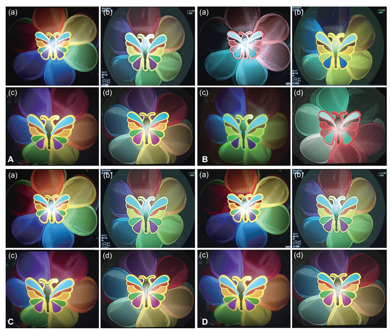
Fig. 1. Butterfly pattern (in vitro) taken according to each endoscopy company, analyzed on each point of evaluation, namely (A) definition, (B) boundary, (C) brightness, and (D) light and shade.

images have a low resolution, the light absorbed by the CCD is composited into RGB to generate color images.<sup>6</sup> I-scan technology is the newly-developed image-enhanced endoscopic technology from Pentax. It consists of three types of algorithms: surface enhancement (SE), contrast enhancement (CE), and tone enhancement (TE). SE improves light/dark contrast and allows for detailed observation of the mucosal surface structure. CE adds blue color in relatively dark areas and allows one to distinguish subtle irregularities around the mucosal surface. With TE, the RGB components of an ordinary endoscopic image are disintegrated into each component, followed by a re-synthesis to yield a reconstructed image. In the Olympus system, NBI is an optical-filter technology that uses two narrow-band filters to provide tissue illumination in the blue and green light spectra.<sup>7</sup> Color management technology has progressed a great deal, yet there remains a limitation in