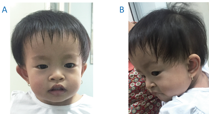
Fig. 1 Facial dysmorphic features of the patient

Fig. 1A-B: The patient presented with rectangular face, hypertelorism, low and flat nose. The mouth was large with a prominent philtrum and a cupid's bow shaped upper lip (carp-shaped mouth), large, protruding ears and short neck.