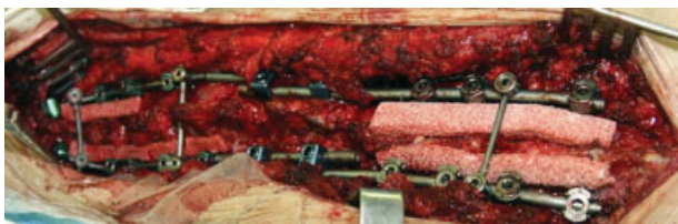
Figure 4 Intraoperative multisupport instrumentation fixation of C2–C9 segments with connector-type system. Posterior local spondylodesis with chronOS strips (Synthes, Oberdorf, Switzerland).

The procedure involved incision at the level of C2–C10 spinous processes after cleaning the operation field. The vertebrae were exposed and hemostasis provided. Evident torsion to the apex of the arch was observed in the superior portion of the thoracic spine. Pairwise interlaminar screws were placed in C2; lateral mass screws (Summit) introduced in C4, C5, C6; and transpedicular and intracorporeal screws