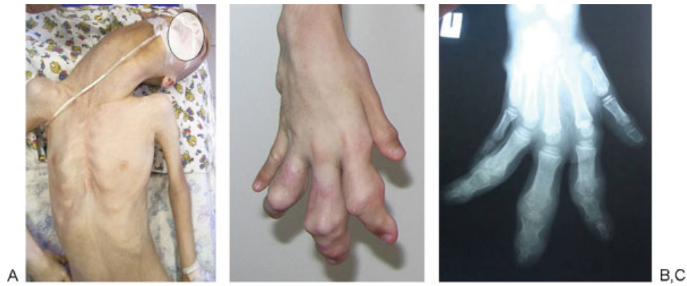
Figure 1 Photo of the patient at the intensive care unit of the regional children’s hospital.

more severe on the right; clinodactyly and hypertrophied phalanges of the fingers; and grade I funnel chest deformity (►Figs. 1A–C). Minimal exercise (walk up to 20 m) caused growing respiratory insufficiency. Neurological assessment showed clear consciousness.