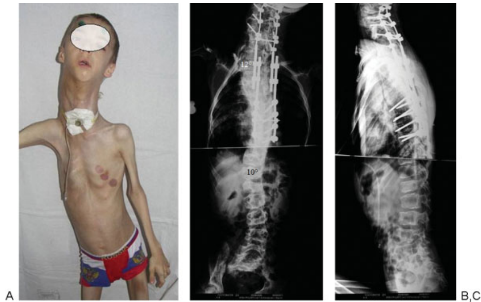
Figure 5 Photo (A) and radiographs (B, C) of the patient prior to discharge. Major arch of the deformity corrected to 12 degrees.

inserted in T6, T7, T8, T9 (on the left) and T6, T7, T9 (on the right). Reliable screw placement was secured by image intensifier. Connecting rods 3.5/5.5 were laid over the fixation points and connected at C6–T6 level bilaterally with four parallel connectors. Acute correction with tensioned rods was produced with distraction provided on the left and compression on the right under protection of methylprednisolone injection. Visual scoliosis correction was 80%. The construct was reinforced by two transverse bars mounted to the cervical spine and one connection plate to the thoracic spine. Frame stability was checked and hemostasis provided. The wound was stitched layer by layer. The system of intratissue anesthesia was incorporated in the wound. The skin was intradermally stitched and dressings applied. The halo-pelvic traction device was dismantled and aseptic dressings placed. Loss of blood volume was 200 mL (5% of the total body volume).