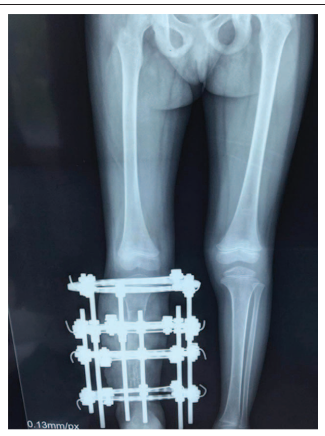
Figure 10. X-rays after the operation and application of Ilizarov ring fixation.

Although the cure rate for CPT is gradually increasing, other concerns, such as leg-length discrepancy, refracture, axial