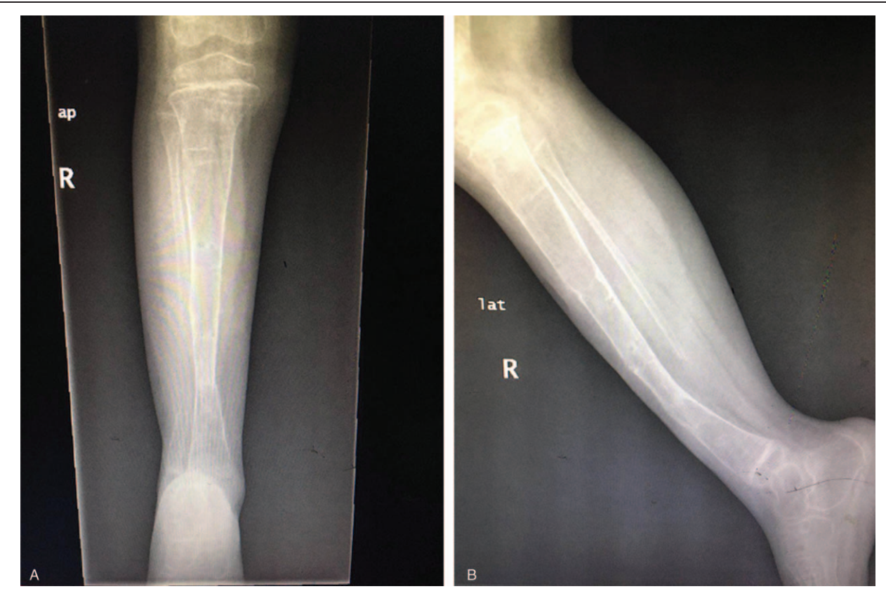
Figure 11. (A, B) After removing the Ilizarov ring fixation.