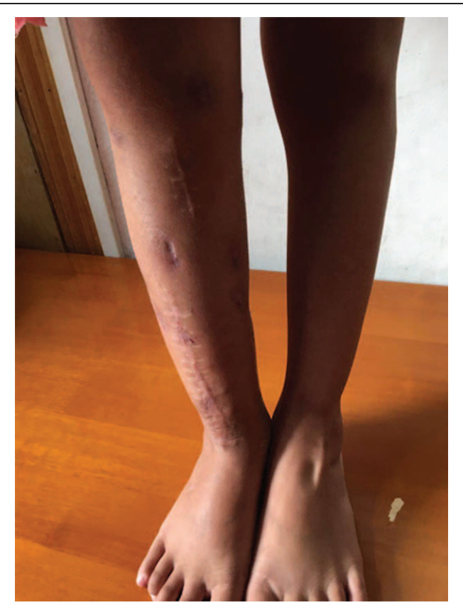
Figure 12. The patient can have full weight bearing and be free of pain.

deformity, progressive malalignment, and ankle valgus, usually influence the final outcome.<sup>[13–15]</sup> One of the main issues is refracture. Any stress on weight-bearing will pass through the weakest point in the link. The united bone is often of inferior biologic and mechanical quality, such as a small docking site, tibial valgus or rotation deformity, and sclerotic bone with no medullary cavity, therefore a protective brace is recommended.<sup>[16,17]</sup>