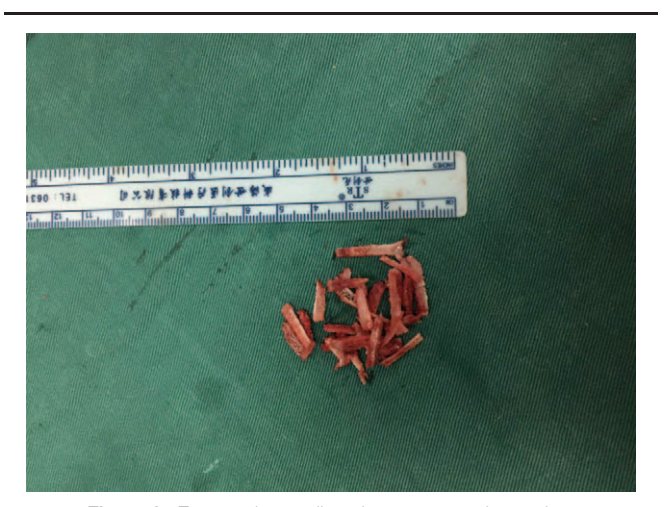
Figure 8. Extracted cancellous bone was cut into strips.

It is presented as CPT usually associated with characteristic anterolateral bowing.<sup>[9,12]</sup> It is often misdiagnosed, because the initial symptoms are very similar to those of fractures. In this case, the patient was initially fixed with a plate because of the apparent history of trauma which led to a misdiagnosis. Managing CPT using steel plates is taboo in this patient population. It must be