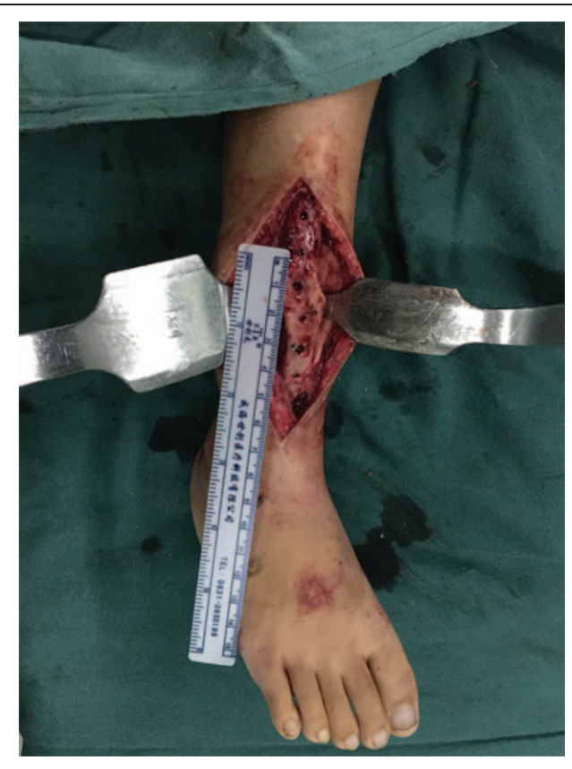
Figure 3. The steel plate was removed and pseudarthrosis was exposed.

new bone was fragile, avoided strenuous exercise for the near joints, and gradually transitioned to full weight-bearing walking. One year postoperatively, we found that the lower limb force line was normal, and lower limb shortening eliminated. The knee joint was not stiff, but ankle dorsiflexion was mildly limited. We believe this is related to the formation of mild forward angled deformities in the lower tibia. The patient can perform full weight-bearing walking without pain (Fig. 12). However, the most important issue that we care about is whether a refracture will occur.