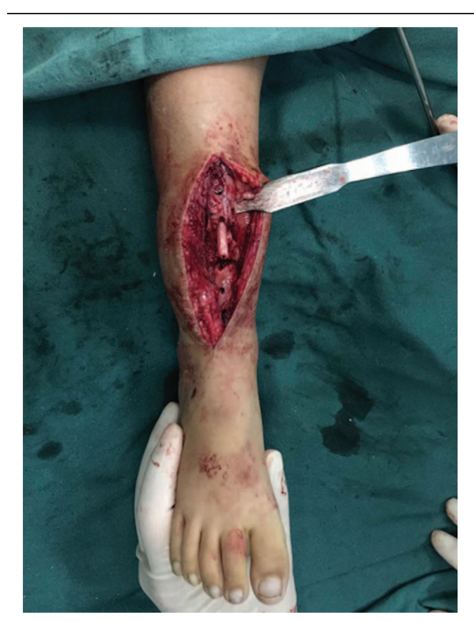
Figure 6. Inserted the fibula into the medullary cavity of the tibia.

The CPT remains challenging for orthopedic physicians because it is difficult to obtain and maintain a solid union.<sup>[6,7]</sup> In this present study, the healing rate with follow-up until many years after reaching skeletal maturity was 60%. In a multicenter study, Ohnishi et al observed that the most acceptable method for treating patients with CPT was with Ilizarov technology and vascularized fibular graft.<sup>[8]</sup> However, those methods do not always guarantee a solid union. Authors have stressed the importance of fixing the fibula and think that the nonunion of the