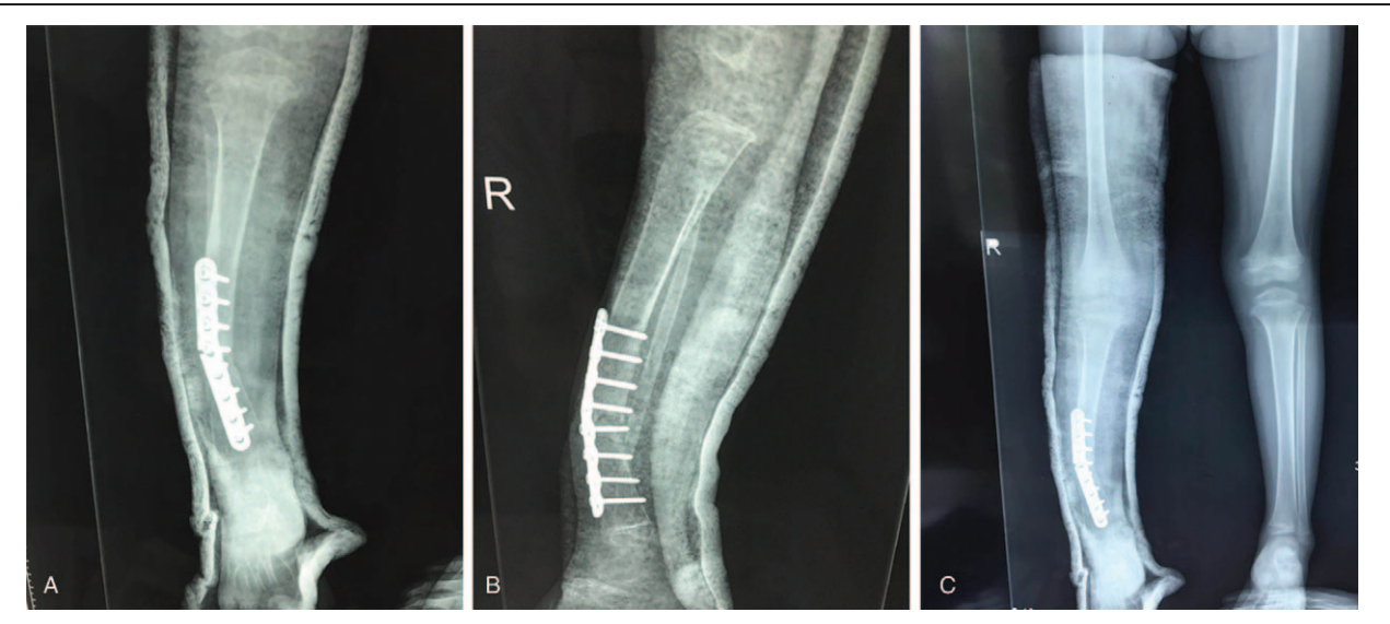
Figure 2. (A-C) Internal fixation broken and tibia angular deformity.

In the postoperative examination, we found that the deformity of the lower limbs was corrected and the line of force was restored (Fig. 10). Patient with external fixation began extending her affected extremity after 1 week, and continued pressure was applied to maintain the stability of the stub and force line. The bones were extended by 1 mm per day. The rod was screwed 4 times a day and 90° each time for the 1/4 turn. The knee and ankle were moved simultaneously to acquire strength. The patient was seen monthly for the 1st follow-up year. X-rays were obtained to determine bone quality. After 9 months, we removed the external fixator (Fig. 11 A, B). Three months after its removal, the patient started to practice partial weight-bearing exercises because the