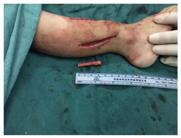
Figure 5. Fibula section was taken.