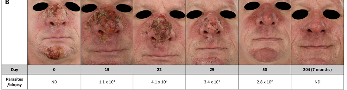
Figure 1. Clinical follow-up of CL lesions. Photographs of two selected lesions in relation to parasite loads in skin biopsies of two CL patients treated with miltefosine from the start of treatment until end of follow-up: A) L. major infection, B) L. infantum infection. ND = not determined. doi:10.1371/journal.pntd.0001436.g001