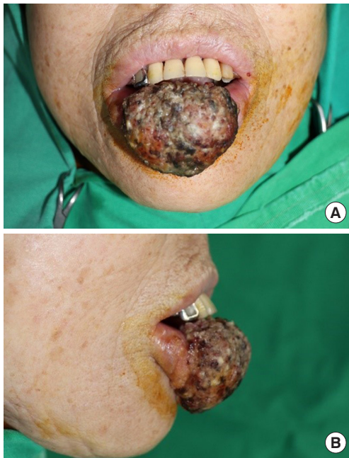
Fig. 1. Preoperative photographs of an 81-year-old woman with a tumor in the lower lip. (A) Anterior view. (B) Lateral view.

other hospital, and squamous cell carcinoma was confirmed. The tumor location was central and did not invade the commissure area. The tumor was pedunculated, being 5 \times 4 \times 2 \text{ cm}^3 in dimensions, with a diameter of 4 cm of the stalk. The total lip width was 6 cm (Figs. 1, 2). Results of imaging examinations indicated suspected pathologic lymph nodes at levels I and II on both sides of the neck. After consulting with the otorhino-