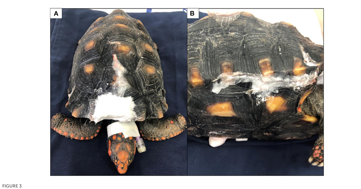
Dorsal (A) and right lateral (B) views of the fractures immediately after the end of the procedure.