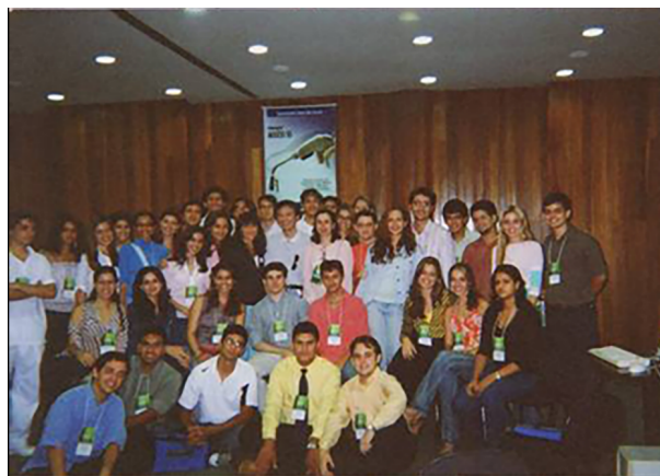
Figure 1 - The Conference of the Brazilian Society for the Development of Surgical Research (SOBRADPEC) held in Natal in 2005 where I had opportunities to interact with young surgeons. The figure shows the young surgeons who attended the “Hands-on Seminar.”