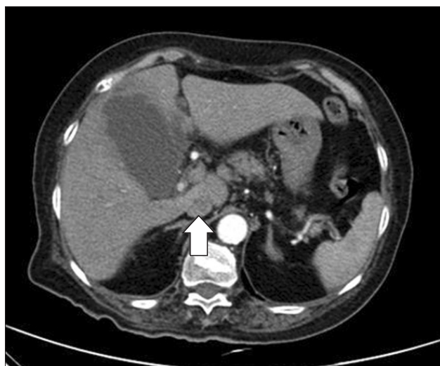
Fig. 1. Precontrast abdominal CT scan shows a gangrenous cholecystitis with confined pericholecystic fluid collection and multiple liver microabscesses (arrow).

Emergency laboratory results were as follows: white blood cell count, 14.4 \times 10^3/L ; erythrocyte sedimentation rate, 102 mm/h; C-reactive protein, 29.39 g/L; total bilirubin, 4.4 mg/dL.