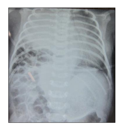
Figure 1: Showing right CDH, and mediastinal shift.

A 21-hour old newborn male, born at a gestational age of 41 weeks and weighing 3.14 kg, presented with respiratory distress. Chest radiograph showed right diaphragmatic hernia and complete opacification of the right hemithorax with displacement of mediastinal structure to the left hemithorax (Fig. 1).