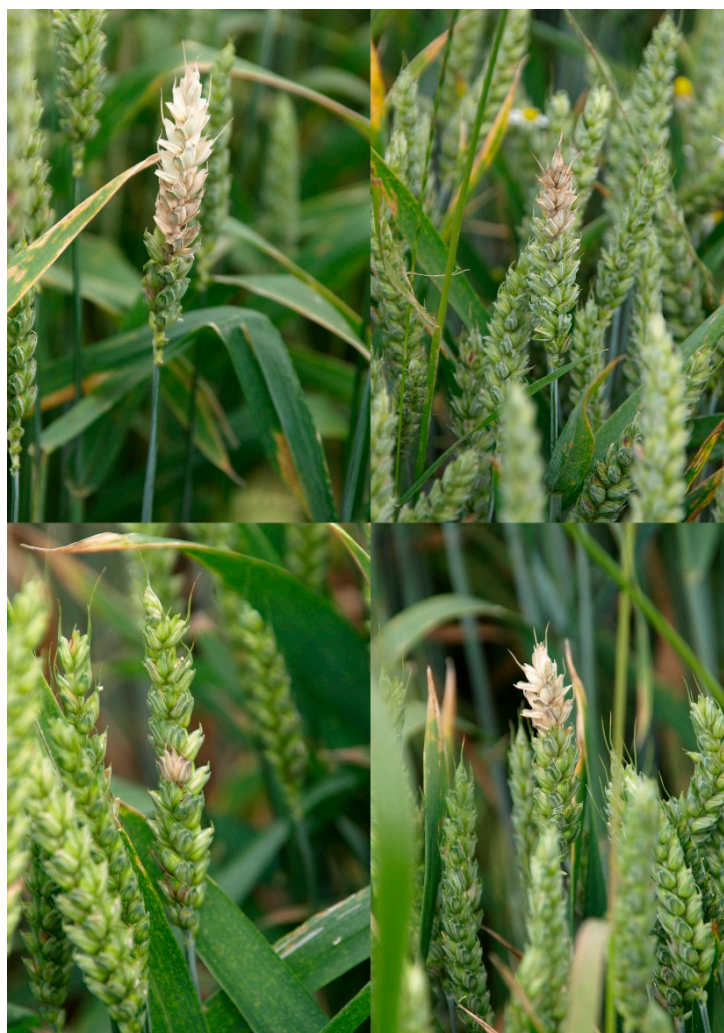
Figure 1. FHB symptoms on heads of wheat grown in organic field. Clockwise from top left: 'Figura', 'Muszelka', 'Kampna', 'Slade'. Wheat at early milk growth stage (BBCH 73).

Cultivars 'Nateja' and 'Legenda' showed no symptoms of FHB and cultivars 'Kampana', 'Muszelka' and 'Slade' were the most infected (FHBi = 4.4%, 3.5%, and 2.1%, respectively) (Table S2). In organic field, FHB index range was from 0 to 3.2%. Cultivars 'Nateja' and 'Mewa' showed no symptoms of FHB and cultivars 'Slade', 'Kampana', 'Turkis' and 'Belenus' were the most infected (FHBi = 3.2%, 2.3%, 1.8%, and 1.8%, respectively). FHB indexes for conventional and organic fields correlated significantly ( r = 0.776 at p < 0.001 ).