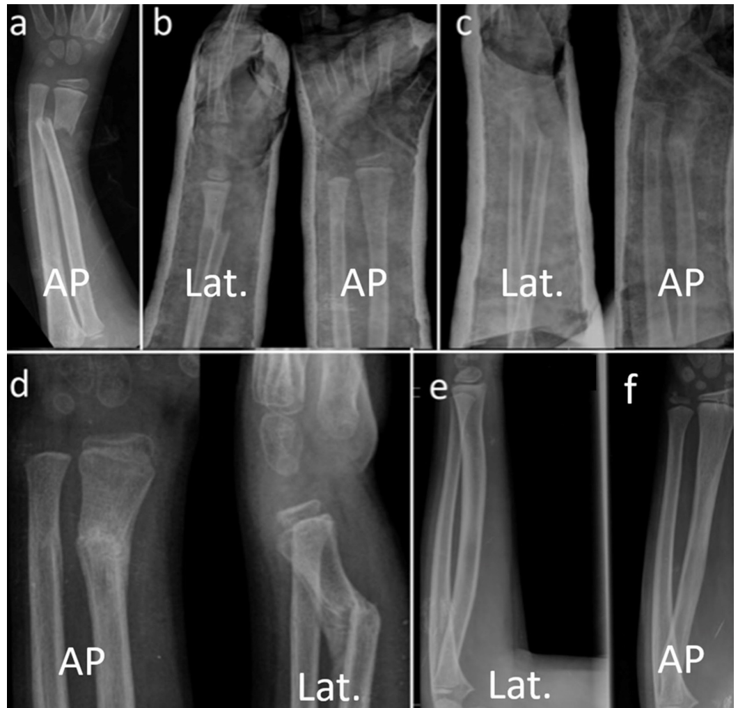
FIGURE 4: Case #2. Serial radiographic examination of eight-year-old girl with distal radial metaphyseal fracture. (a) Initial radiograph on admission. (b) Immediate closed reduction, the angulations were in acceptable range in both planes. (c) Re-displacement in cast. (d) Radiographs after the cast removal. (e,f) Final radiographs at 30th month showing full remodeling and normal alignment.