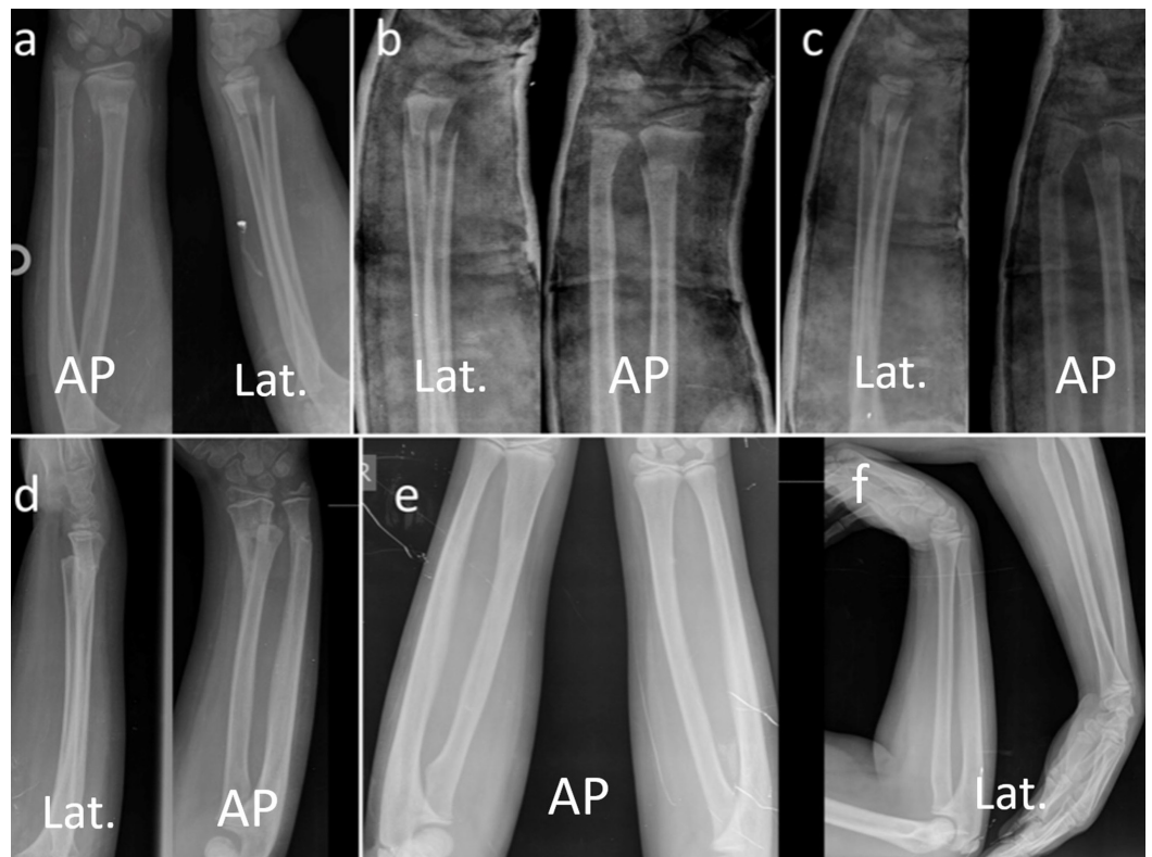
FIGURE 3: Case #1. Serial radiographic examination of seven-year-old girl with distal radial metaphyseal fracture. (a) Initial radiograph on admission. (b) Immediate closed reduction, the angulations were in acceptable range in both planes. (c) Re-displacement in cast. (d) Radiographs after the cast removal. (e,f) Final comparison radiographs with the un-injured side at 30th month showing full remodeling and normal alignment.