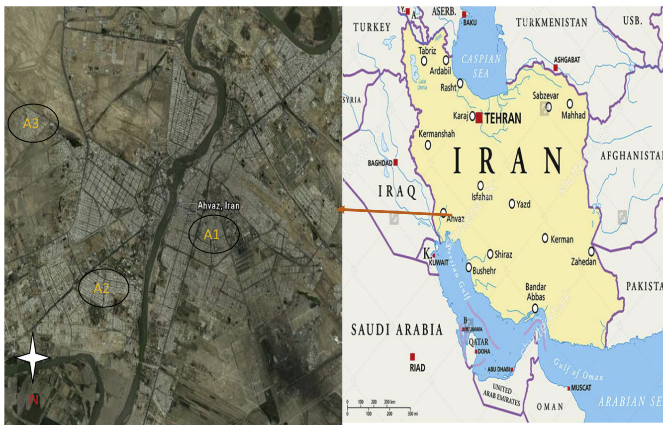
Figure 1 Map of sampling site (A 1 , A 2 and A 3 ).

We assembled a manmade device, which consisted of a glass soxhlet extractor condenser, water flow pumps, thermometers, exhaled breath collection location and electrical power supply for sampling the exhaled breath condensate according to devise previously described by Sakhvidi et al. (2015) (Fig 2). In order to blow the exhaled air within the device a flexible tube was used. Ice water (with a temperature of zero degrees Celsius) that had been dumped in a 2-liter container was guided through the plastic tube condenser and again returned into the container by turning a spiral flow inside condenser, and cooling the inner chamber of condenser. Exhaled air reached the saturation conditions through the inner part of the condenser glass that was cooled by water flow, and then its moisture remained on the walls of the condenser. Produced drops on the inner surface of the condenser were guided into a micro-tube that was placed under the condenser and was kept in the micro-tube. To collect the exhaled breath samples initially all participants were asked to hold their nose by using a clamp, and then asked to blow into the mouthpiece with a