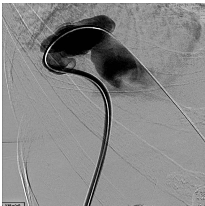
Figure 2. Transhepatic venogram with selective injection of the right posterior portal vein demonstrates portovenous shunt in segment 7 with massive hepatic vein dilation and lack of portal perfusion of liver.

An abnormal connection between the portal and systemic circulation is known as a portosystemic shunt. These can be