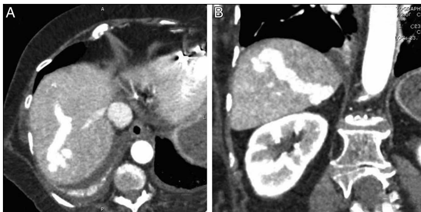
Figure 1. (A) Axial contrast-enhanced computed tomography demonstrating segment 7 large intrahepatic portovenous shunt and (B) coronal contrast-enhanced computed tomography demonstrating segment 5 large intrahepatic portovenous shunt.

Similar technique was used to intervene on the second large intrahepatic portovenous shunt in segment 5 and resulted in stagnant flow postembolization. A final main portal venogram demonstrated enhanced visualization of the hepatic parenchyma and no hepatofugal flow (Figure 3). On follow-up, the patient had no further episodes of hepatic encephalopathy and ammonia levels were normalized to 32 \mu\text{mol/L} .