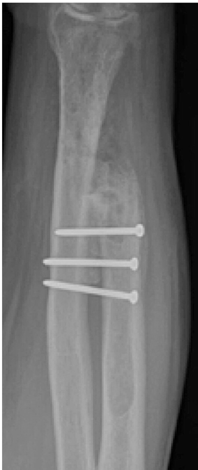
Fig. 4. This image reveals the subsequent outcome procedure of a fused ulna and radius once the APTIS implant was removed.