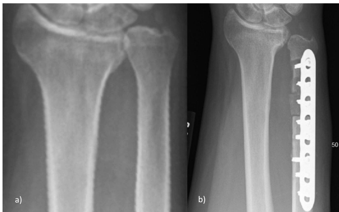
Fig. 1. a: This image shows the initial ulnar positive variance that caused the patient great pain. b: This image shows that the patient's ulnar shortening osteotomy was unsuccessful, as the distal part of the ulna resulted in a non-union.