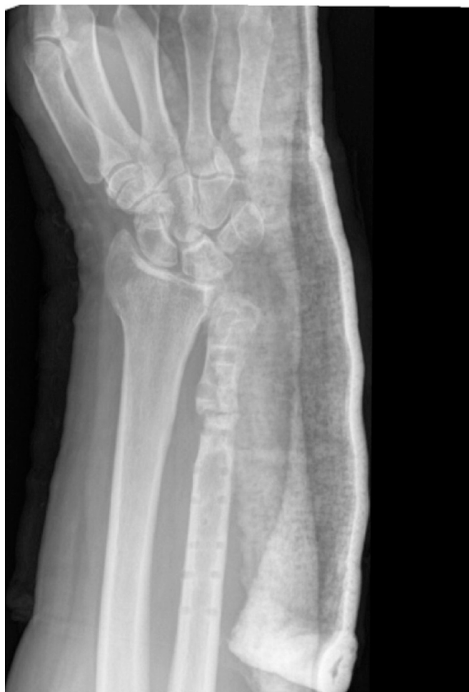
Fig. 2. This image shows that the failed revision surgery resulted in a structurally compromised distal ulna and unstable DRUJ.