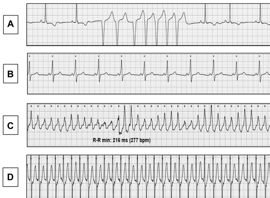
Figure 3. Examples of rhythm strips recorded with the CardioSTAT monitor on different participants: (A) nonsustained ventricular tachycardia in a hypertrophic cardiomyopathy patient; (B) a patient with Wolff-Parkinson-White syndrome in sinus rhythm; (C) a patient with wide complex tachycardia that proved to be caused by a Mahaim fiber upon electrophysiologic study; and (D) supraventricular tachycardia in a symptomatic 10-year-old boy. bpm, beats per minute; min, minimum.