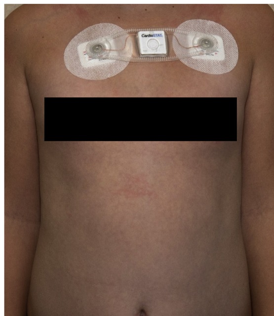
Figure 1. Horizontal positioning of the CardioSTAT device at the second intercostal space above the sternum in a 9-year-old child.

A total of 23 children (16 boys), aged 9.3 \pm 2.3 years, were recruited. Their mean weight and height were 27.9 \pm 10.6 kg, and 123.3 \pm 31.3 cm, respectively. Tracings recorded with a standard ECG in lead D1 were compared with those obtained using the CardioSTAT. The following rhythms were evaluated: 9 sinus rhythms (including tracings with abnormal QRS morphologies such as bundle branch