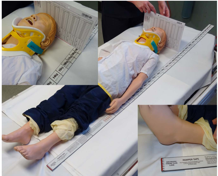
Figure 1 Images showing the demonstration of the Paediatric Advanced Weight Prediction in the Emergency Room (PAWPER) tape.

Advanced Weight Prediction in the Emergency Room (PAWPER) tape (figure 1) 15 16 and the Mercy method, that modified weight estimations using body habitus. 17–19