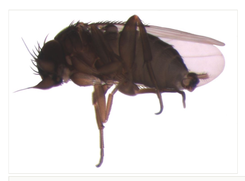
Figure 3. Ceratoconus setipennis male, lateral/ventral view.