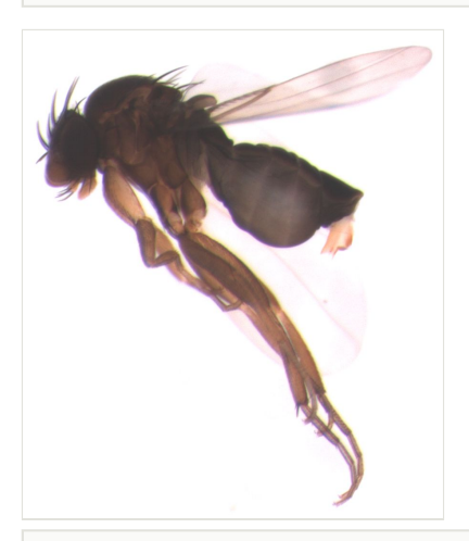
Figure 2. Ceratoconus setipennis female, lateral view.

Figure 1. Pheidole sp nest on the underside of a Chamaedorea palm leaf.