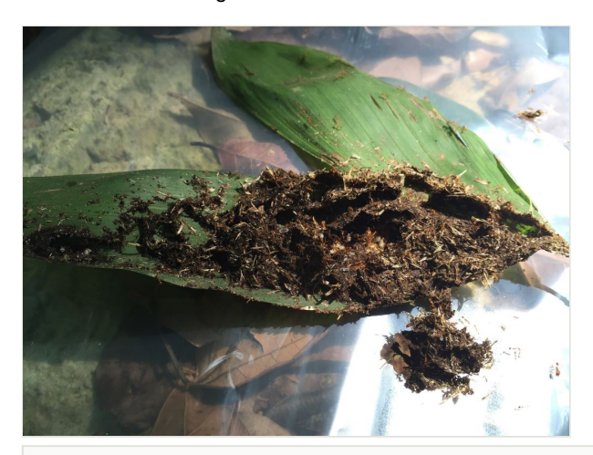
Figure 1. Pheidole sp nest on the underside of a Chamaedorea palm leaf.

In Brazil, ant nests were located by cutting open rotting logs in early November 2016. The exposed colonies were then observed to record phorid fly attack. Footage at the Estação Biológica de Boracéia was obtained with both an Olympus OMD-EM1 outfitted with a 60 mm Olympus macro lens (Figs 4, 6) and a Samsung Galaxy s6 Edge with a clip-on macro lens by Pocket Lens (Fig. 5). All specimens from Brazil were deposited in the collection of the Museu de Zoologia da Universidade de São Paulo.