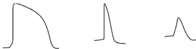
FIGURE A1 Three general types of action potential for human cardiomyocytes