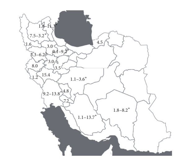
FIGURE 2: Graphic representation of prevalence (%) of HCE in provinces in Iran. The asterisk (*) means the minimum and maximum of prevalence in province.

to heterogeneity rather than chance, with a range from 0 to 100 percent (values of 25%, 50%, and 75% are considered to represent low, medium, and high heterogeneity, resp.). Subgroup meta-analysis analysis was used to compare the prevalence of hydatidosis among age, sex, and lab methods groups. Egger's test was used to evaluate the publication bias [14, 15]. Statistical analyses were conducted using the Statistical Software Package (STATA) version 11.1.