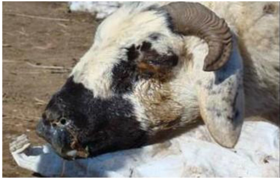
Fig. 2 Thick discharges from the nose, nostrils and eyes.

clinical signs are highly characteristic. Additionally, a simultaneous infection with orf and peste des petits ruminants can cause the clinical signs of SPP or GTP with skin lesions occurring from orf and lung lesions and nasal discharge from PPR (OIE 2008).