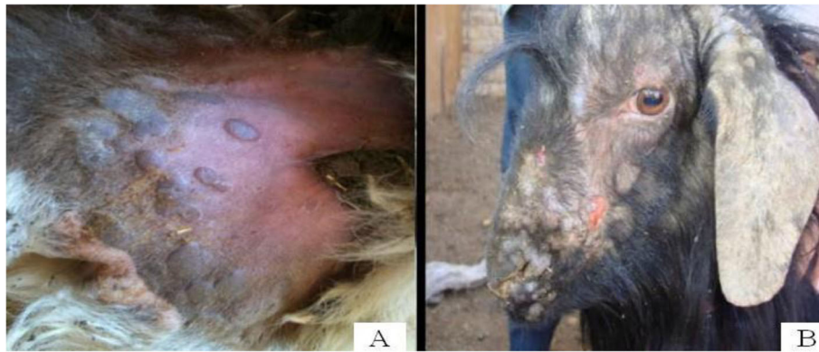
Fig. 4 Popular lesions under the tail (A). Source (Zangana and Abdullah 2013). Pox lesions on the face and ears (B). Source (Mirzaie et al. 2015)

Viral isolation is required to validate the infectivity of the agent. Thus, primary cell lines can be used to isolate SPPV from GTPV (Babiuk et al. 2007). Additionally, PCR is a simple and convenient technique to detect CaPV genomes in tissue samples (Lamien et al. 2011), but it is impossible to discriminate between GTPV and SPPV (Rao and Bandyopadhyay 2000). However, sequencing of the P32 (Zeng et al. 2014) and GpCR genes was used to distinguish these viruses (Yan et al. 2012; Sumana et al. 2020). Additionally, a specific and sensitive duplex PCR technique was applied to the differential analysis of GTPV and SPPV, particularly in resource-limited endemic countries (Zhao et al. 2017). Likewise, real-time PCR containing a snapback primer and a DNA intercalating dye (Gelaye et al. 2013) and a real-time high-resolution melting PCR assay have been developed (Pestova et al. 2018).