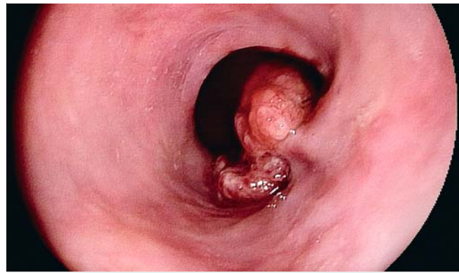
► Fig. 2 Endoscopic image of primary lesion before definitive CRT in a 78-year-old male.

Subsequently, the follow-up was similar to that in Patient 1. Complete endoscopic and histological remission of cancer sustained for 37 months. CT scan 1 year after endoscopic resection presented no signs of metastases. Three years and 8 months after achieving complete remission, the patient died of massive intracerebral hemorrhage, a non-tumor-related cause.