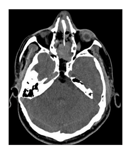
Figure 2: Postoperative axial brain computed tomography