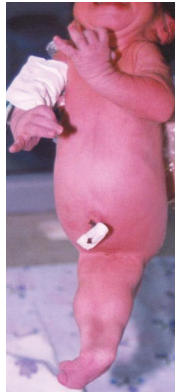
Fig. 2 Anterior view of a neonate with sirenomelia.

In the entire radiography of the body, there were sacral bone agenesis and pelvic bone agenesis. There were femur bone and two tibia bones and a fibula bone and two heel and toes were seen. During patient hospitalization, the neonate had urinary excretion as a droplet, but no excretion of stool was observed. The neonate developed shortly after birth, abdominal distension, bile vomiting, and oral intolerance.