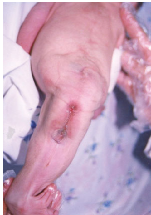
Fig. 3 Posterior view of a neonate with sirenomelia.

The neonate was fed intravenously during life. Neonate bile vomiting continued with fecal material removal, and after that, the neonate died 4 days after birth with a block of bowel obstruction and generalized peritonitis (► Video 1 ). The parents did not consent to do an autopsy. Chromosome examination was not done.