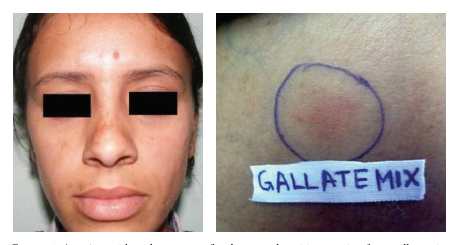
FIGURE 4: A patient with malar pattern of melasma and positive reaction from gallate mix.

changes too have been ascribed to its use. Dandale et al. [21] documented positive reactions from PPD in 8.6% patients of facial melanosis. Mehta et al. [27] also described a case of pigmented contact cheilitis from PPD. Our 2 patients and one control had positive reaction to PPD but never had clinical contact dermatitis despite using hair colors in the past or perhaps being subtle clinically it remained unnoticed. Jasmine synthetic, chloroacetamide, isopropyl myristate, vanillin, bronopol, sorbic acid, 2-(2-hydroxy-5-methyl-phenyl) benzotriazole, germall 115, hexamine, quaternium 15, geranium oil, butylated hydroxyanisole, and triethanolamine, the common additives to cosmetics/skin care