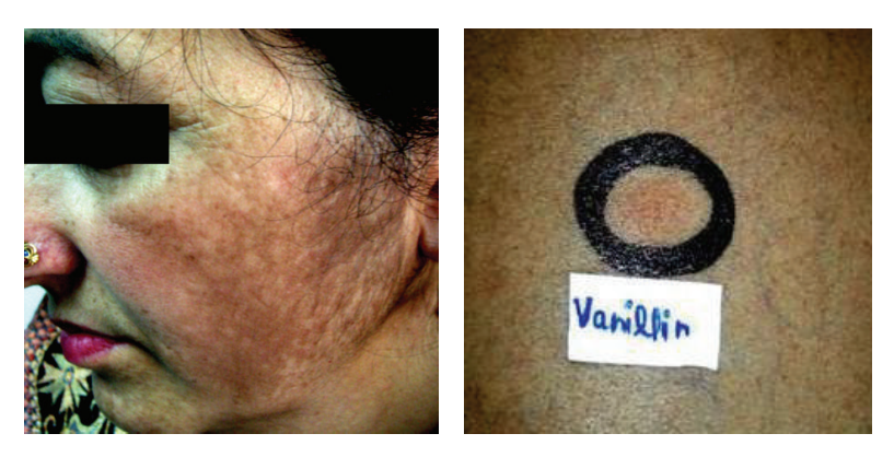
FIGURE 6: Positive patch test from vanillin in a patient with diffuse-to-reticulated mandibular pattern of melasma.

it is possible that our patient was sensitized from other cosmetics or pharmaceuticals used in the past. The reported sensitivity from isopropyl myristate, an emollient, fragrance, and skin-conditioning agent, was 1.2% in 244 patients with cosmetic contact dermatitis in a study from Israel [29]. Although our patient showed positive patch test reaction from isopropyl myristate, cosmetic cream itself did not elicit positive reaction in her despite isopropyl myristate being one of the listed ingredients in "Fair & Lovely" cream that she had been using for over 6 years. Perhaps this ingredient is present in much lower concentration in finished cosmetics product than used for patch testing. Although vanillin, a substituted aromatic aldehyde and a fragrance, is known to induce skin sensitization in humans [30], it is often considered secondary allergen in patients sensitized to Myroxylon pereirae and positive reactions to vanillin (pure or 10%) were reported in 8/142 and 21/164 of such patients [31]. Vanillin elicited positive reaction in a female (Figure 6) who had been using various cosmetics (cold creams, soap).