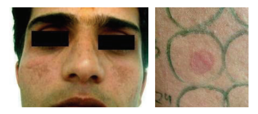
FIGURE 7: Positive patch test from sorbic acid in a patient with malar pattern of melasma.

and deodorants while hexamine is used as a solvent in cosmetics. Quaternium 15, a preservative in creams/lotions, shampoos, and soaps, elicited positive reaction in 1 (2.8%) of 35 patients of cosmetic dermatoses [20]. Geranium oil, another fragrance ingredient, caused positive reaction in our one male patient along with positive reactions from gallate mix and phenyl salicylate and he was using face wash, shaving cream, after shave lotion, soaps and hair color. Geranium oil contact sensitivity has also been reported previously in 10% of 50 patients with cosmetic dermatitis [15]. One male patient who had positive patch test from butylated hydroxyanisole (antioxidant in cosmetics), triethanolamine (surface-active agent in soaps, shampoos), and gallate mix was using fairness creams, antiacne (herbal) cream, and soaps but elicited no positive reaction from these products. The reported positivity from these cosmetic ingredients is 8.7% in patients with cosmetic contact dermatitis [35].