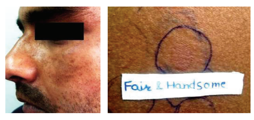
FIGURE 2: Irritant patch test (Janus type) reaction from Fair & Handsome cream in a male with malar pattern.