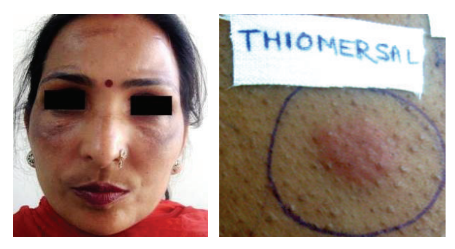
FIGURE 5: A patient with centrofacial melasma and positive reaction from thiomersal.