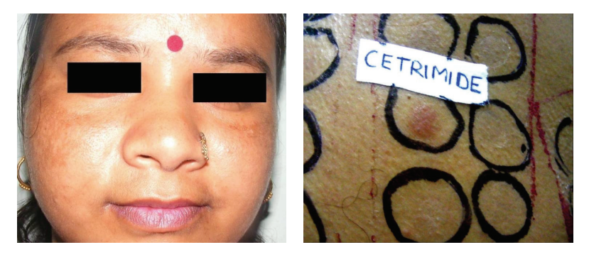
FIGURE 3: A patient with malar pattern of melasma and positive patch test from cetrimide.