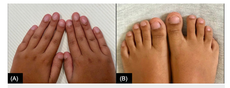
FIGURE 1: Generalized digital clubbing.

Unit (PICU) admissions and two endotracheal intubations. Two weeks prior to our initial encounter, the patient was admitted to the PICU for four days due to an acute episode of shortness of breath and associated chest pain with hypoxemia. On initial presentation to our clinic, the patient required 24-hour oxygen supplementation via nasal cannula at 2 L per minute (LPM). Pulse oximetry was 92-95% with a nasal cannula on rest and decreased to 80-85% on room air with physical activity. Physical examination demonstrated a chronically ill-appearing 13-year-old boy with a heart rate of 114 beats per minute, respiratory rate of 25 breaths per minute, oxygen saturation of 92% at 2 LPM, body mass index of 18.16 (45th percentile), generalized digital clubbing of both upper and lower extremities (Figure 1), and lungs clear to auscultation bilaterally.