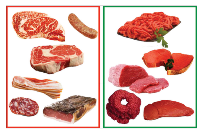
Figure 1: Meats rich in visible fat and preservatives (red box on the left) have been demonstrated to increase cardiovascular risk while lean fresh red meat (green box on the right) has not