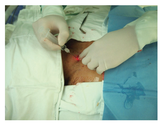
Figure 2 . Visualization of the trachea. During the procedure, transillumination of the light source helps visualize and puncture the trachea more accurately than tactile sense alone.