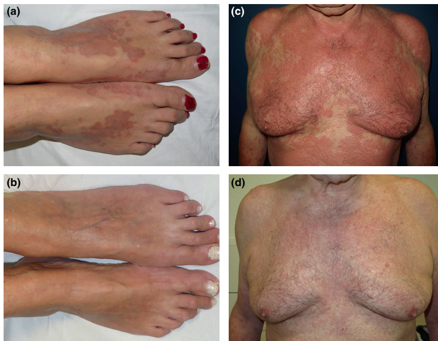
FIGURE 1 Generalized granuloma annulare. Baseline and after tofacitinib treatment. (a) and (b) (patient 12). Granuloma annulare lesions on the dorsal aspect of both feet before and 8 months after initiating treatment. (c) and (d) (patient 13). Granuloma annulare lesions on anterior chest before and 6 months after initiating treatment

the formation of papules and plaques with annular and acral distribution. 1 GA is often limited and self-resolving, but in some cases, it can be generalized and refractory to