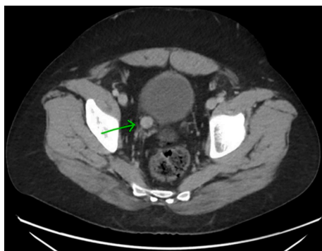
Fig. 1. Axial CT - Ovoid enhancing lesion in the distal right ureter.

This unusual case highlights some other useful strategies for the management of RCC. Firstly, in patients with a renal mass wherein UC is not excluded after multiple diagnostic procedures, intraoperative frozen section during nephrectomy can be used to guide decisions regarding concurrent ureterectomy. Secondly, the authors found the placement of ureteric catheters very helpful in performing the distal ureterectomy in this patient. Having ureteric catheters within both remnant ureters helped to define the extent of excision required, including removal of an adequate bladder cuff for a complete duplex system. Equally, having a ureteric catheter in the contralateral ureter helped with its protection during the procedure.