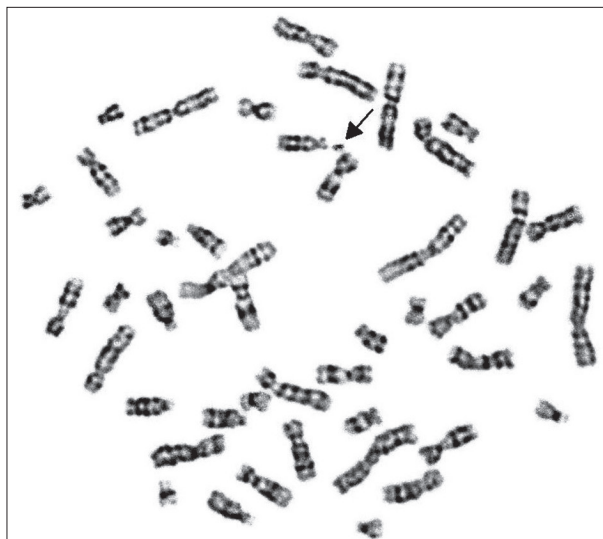
Figure 2. The marker chromosome revealed by conventional karyotyping at the age of 3 before pre-B-ALL developed is indicated by an arrow.

Chromosomal Microarray Analyses. The analysis was performed using the Infinium HD whole-genome genotyping assay with the HumanCytoSNP-12 BeadChip (Illumina Inc., San Diego, CA, USA) that was done according to standard protocol provided by the manufacturer. This array platform contains 299,140 SNPs distributed across the human genome with an average resolution of 31 kb. Genotypes were called by GenomeStudio Genotyping Module v2.0 (Illumina Inc.). Log R ratio and B allele frequency (BAF) values were extracted from GenomeStudio software and used in further copy number variation (CNV) analyses and breakpoint mapping with Hidden Markov Model-based QuantiSNP software (v1.1) [4]. Constitutional copy number polymorphisms were excluded based on comparison with the Database of Genomic Variants ( http://projects.tcag.ca/variation ).