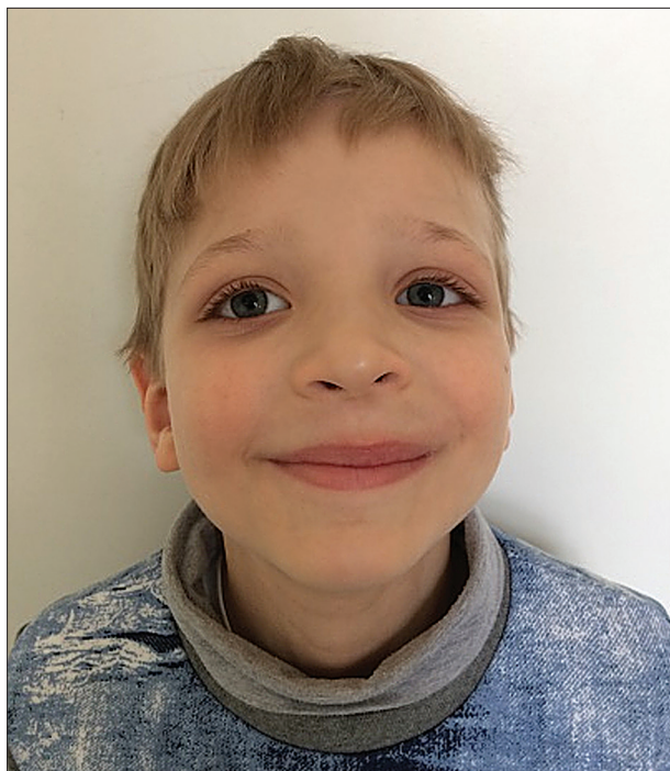
Figure 1. Dysmorphic facial features of the proband at the age of 6: a broad flat nose, down slanting palpebral fissures, hypertelorism, and mild ptosis are noted (permission of parents to publish the picture was obtained).