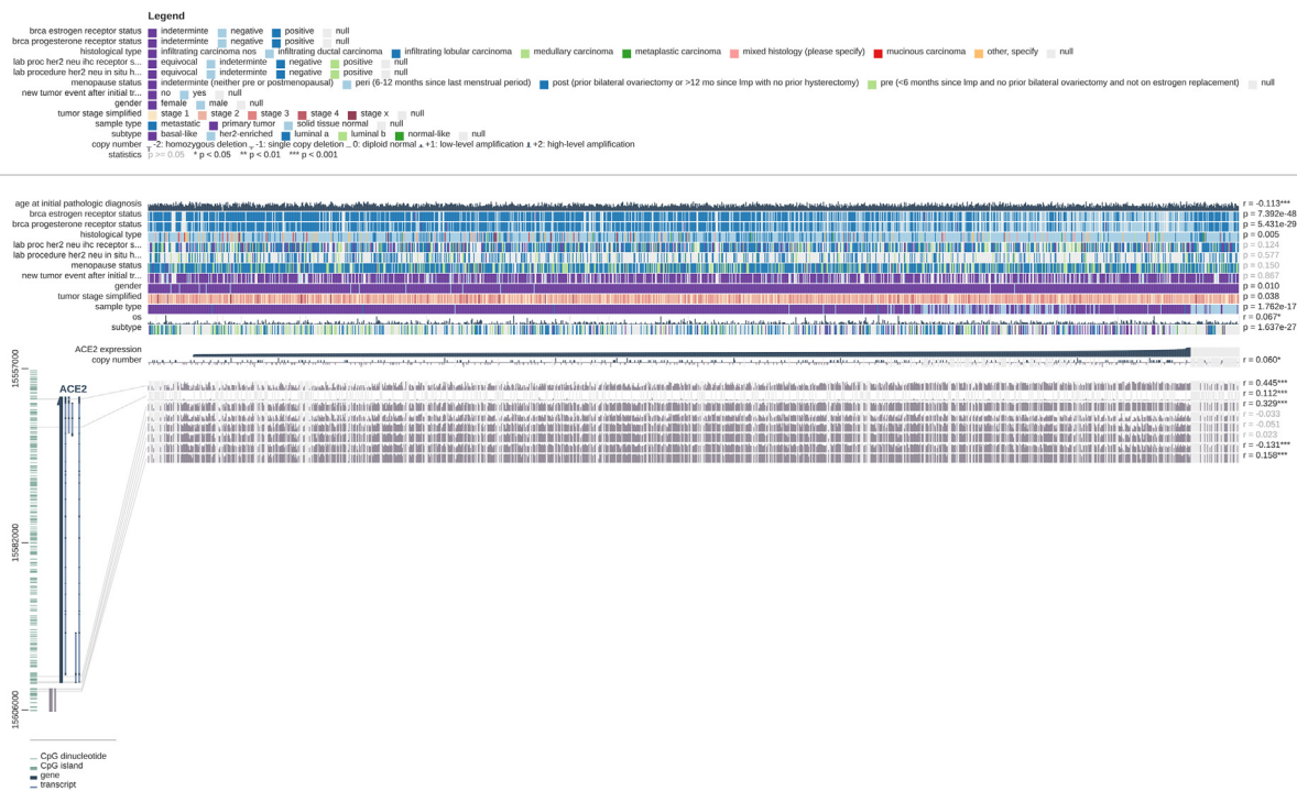
Fig. 2. ACE2 and breast cancer MEXPRESS visualization ( https://mexpress.be , PMID: 31114869) of the TCGA expression/Infinium DNA methylation data for ACE2 in breast invasive carcinoma (n = 1268) (A) The default view, in which the samples are sorted by their ACE2 expression levels and the samples without expression data were removed. The figure and the statistics on the right hand side show significant cpG probe methylation correlation with gene expression (P-values) or Pearson correlations (+ or -) between ACE2 expression and gene region specific DNA methylation. (B) All breast cancer samples have been divided into two groups based on their ACE2 expression level (high/low expression). The horizontal lines at each probe location indicate the median percentage of methylation (B-value of 1 = 100% DNA methylation), whereas the vertical lines mark the range between the 25th and the 75th percentile.

cancers while a few renal, urothelial, lung, colorectal and pancreatic cancers showed weak to moderate membranous and/or granular cytoplasmic immunoreactivity and other tumor types were negative (The Human Protein Atlas). A provocative recent study by Montopoli et al [37] showed that downregulation of the expression of TMRSS2 by androgen deprivation therapy decreased the susceptibility of prostate cancer patients to develop COVID-19, suggesting new therapeutic options. Hormonal manipulations (such as estrogens, luteinizing hormone releasing hormone agonists) could be considered as preventive measures in specific contexts. It is worth mentioning that the effect of TMRSS2/ERG gene fusions had differing effects on radio- and chemosensitivity depending on cell line and fusion type, suggesting that binding and altered expression of this gene by a SARS-CoV-2 infection may have implications for effectivity of treatment of cancer patients [82].