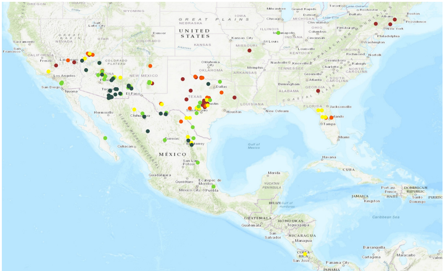
Fig 1. Graphical presentation of the PD resistance of accessions from each collection location based on ELISA readings of stem tissue after greenhouse testing. The data were grouped into five categories based on log-transformed estimations of bacterial levels: 1 = green, highly resistant (6.9–9.1); 2 = light green, resistant (9.2–11.1); 3 = yellow, moderately susceptible (11.2–13.1); 4 = orange, susceptible (13.2–15.1); and 5 = burgundy, highly susceptible (15.2 and above).

https://doi.org/10.1371/journal.pone.0243445.g001