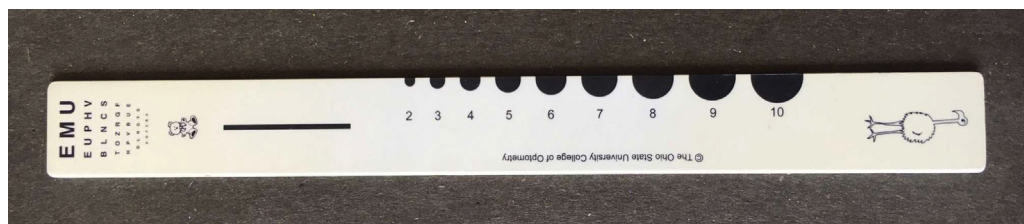
Figure 1 Ruler used for gross assessment of pupil size. The numbers adjacent to the black “half moons” indicate the pupil diameter in millimeters. Pupils of size determined to be between two of the “half moons” were assigned a size half way between the two. For example, if the pupil size was between that of number 4 and number 5, the size was assigned a value of 4.5 mm.

To determine whether the proportion of subjects with anisocoria \geq 0.5 mm differed based on the method of assessment, McNemar’s test of within-subjects proportions was used to compare the gross measurement technique with the infrared photograph technique. For horizontal anisocoria assessed under photopic conditions, the unsigned difference in proportions was 0.4425 (two-tailed p < .000001 , odds