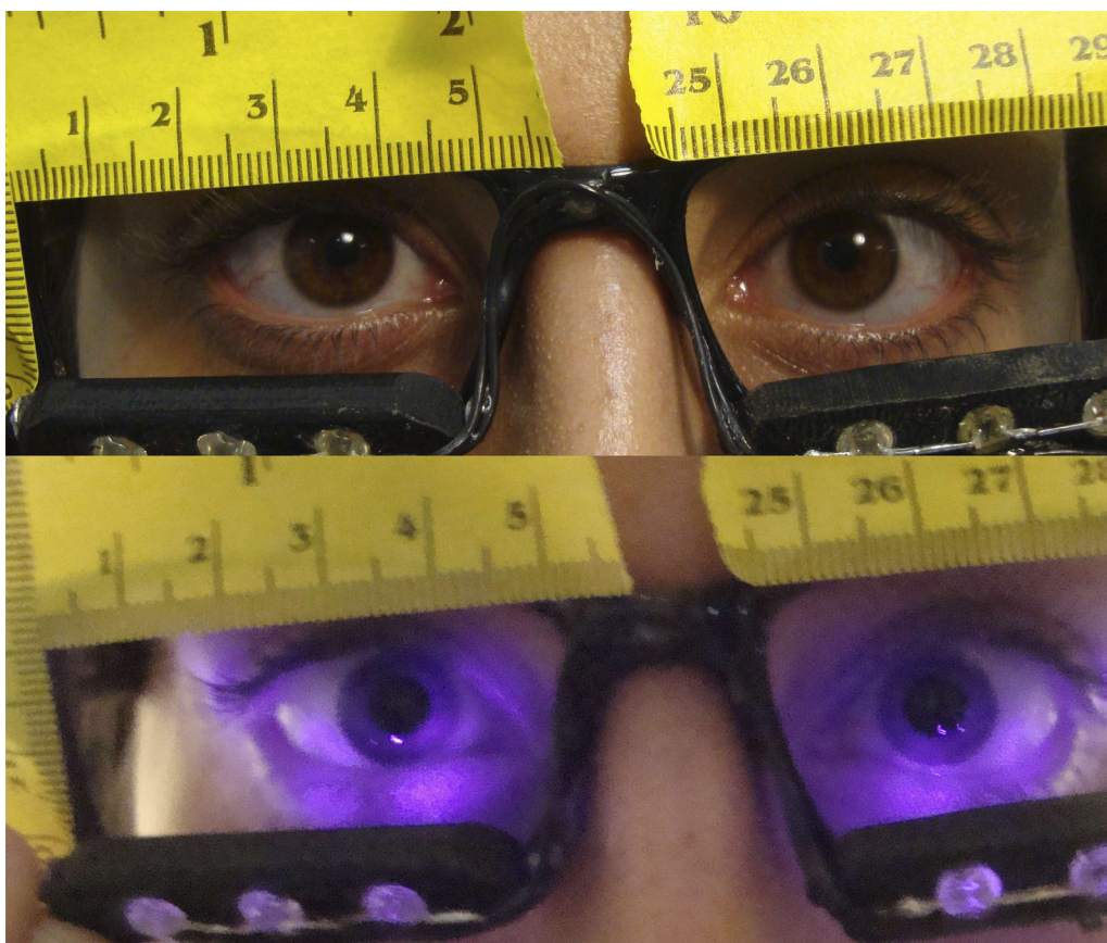
Figure 2 Custom-build infrared light source used for digital pupillometry (Shazly et al. 9 ). The top photo was taken in normal room light with the infrared LEDs turned off. The bottom photo was taken with room lights off and the infrared LEDs turned on.

ratio = 8.14, 95% CI of odds ratio 3.7–17.9). For vertical anisocoria assessed under photopic conditions, the unsigned difference in proportions was 0.469 (two-tailed p < .000001 , odds ratio = 14.25, 95% CI of odds ratio 5.2–39.3). For horizontal anisocoria assessed under scotopic conditions, the unsigned difference in proportions was 0.4602 (two-tailed p < .000001 , odds ratio = 8.43, 95% CI of odds ratio 3.9–18.5). For vertical anisocoria assessed under scotopic conditions, the unsigned difference in proportions was .5045 (two-tailed p < .000001 , odds ratio = 19.7, 95% CI of odds ratio 6.2–62.7).