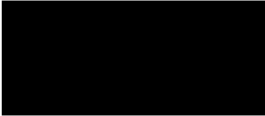
Figure 1: Manufacturing process