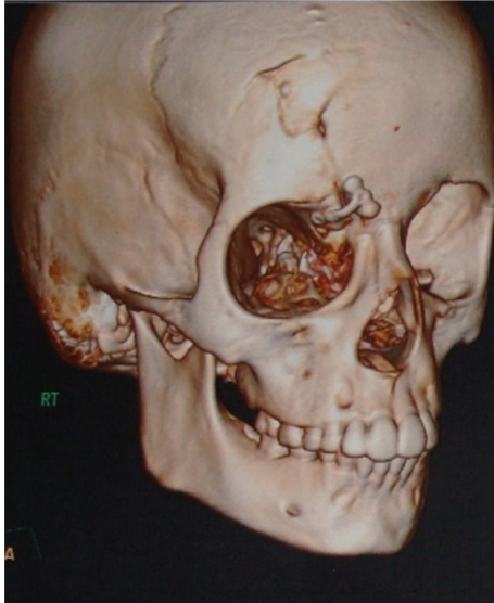
FIGURE 4: Postoperative 3D CT scan revealing titanium plate and screws intact at the fracture site.