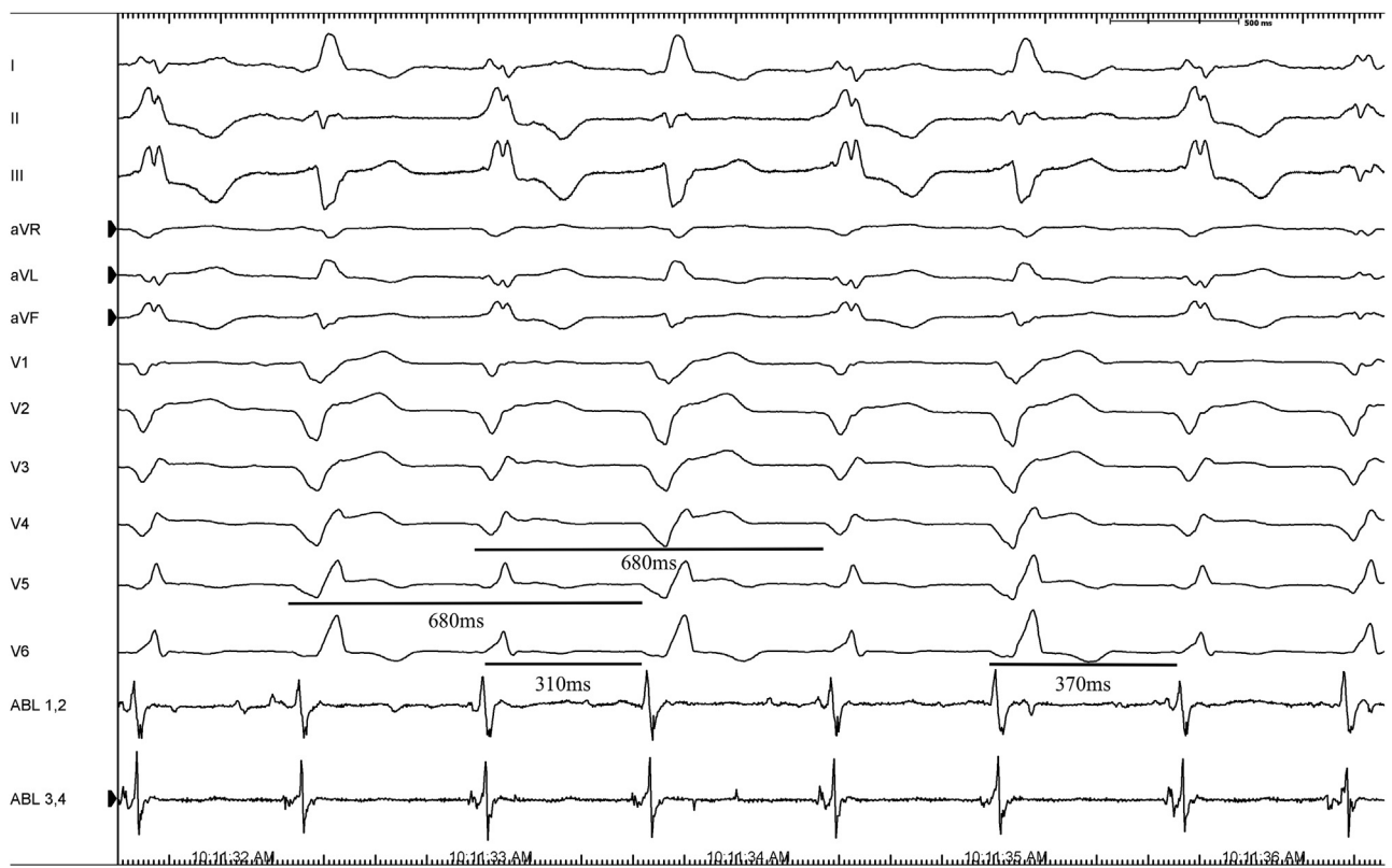
Figure 2 Second ventricular tachycardia (VT2) that occurred after the first radiofrequency application was delivered. VT2 exhibited a shorter but regular alternating cycle length associated with alternating morphology on the surface electrocardiogram and near-field electrogram.

manifesting despite a longer TCL. However, with RF #1 applied in a protected area, the VT1 exit site was blocked and the VT circuit was left with the exit sites for VT2 with no colliding wavefront previously from VT1, leading to the manifestation of VT2. The local EGM of ablation 1–2 in Figure 2 showed consistent alternating morphologies with each alternating ECG surface morphology during VT2, suggesting alternating wavefronts colliding at the ablation distal bipole, which would be in keeping with multiple exit sites.