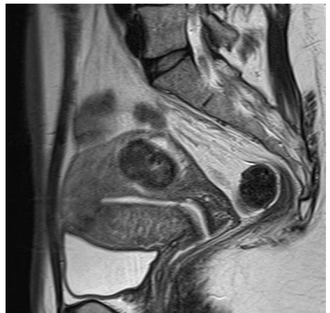
Figure 4. MRI image of the one month after operation.

Note: Fluoroscopy shows the inflation of the balloons occluded in the common iliac arteries bilaterally (A: right and B: left).