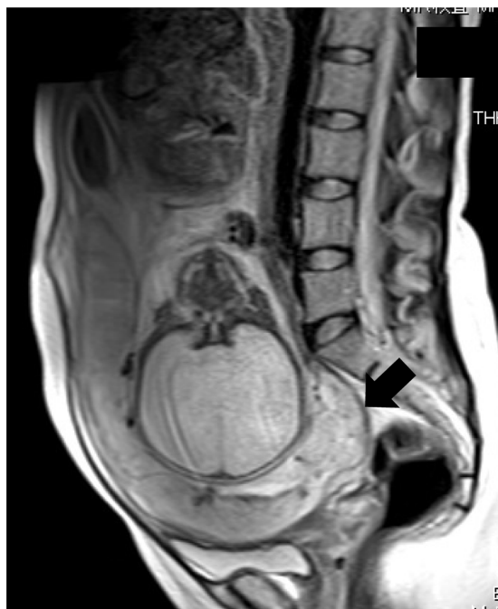
Figure 1. MRI image of the abdomen.

A 37-year-old primigravida, who was diagnosed with a placenta previa totalis, was referred and admitted to our hospital due to threatened premature labor at 33 weeks gestation. She married at 32-year-old and had a history of a hysteroscopic examination for fertility. An initial ultrasonography and MRI image showed that the placenta, which completely covered the internal os, was located mainly on the anterior uterine wall to the level of the maternal umbilicus and suspected placenta accrete located lower posterior uterine wall (Fig. 1). At 35 weeks and 2 days of gestation, because of continuous genital bleeding, cesarean section (transverse fundal uterine incision) assisted temporary balloon occlusion procedure was planned. Both the patient and her family agreed to the possible risk of hysterectomy and blood transfusion, if medically necessary. However, they did not desire subsequent pregnancy. In the operation room, at first, bilateral femoral arteries punctures were performed and 5-Fr vascular sheaths (Terumo Corporation, Tokyo, Japan) were inserted under local anesthesia with subcutaneous injection of lidocaine by radiologist and vascular specialist. Under fluoroscopy guidance, selective catheterization of the bilateral common iliac