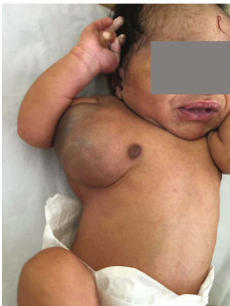
FIGURE 1: Photograph showing left axillary cystic hygroma.