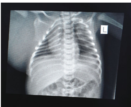
FIGURE 2: Plain chest X-ray showing homogenous soft tissue lesion left axillary region.

and was discharged after ten days with no complications. The histology results confirmed features of cystic hygroma (Figure 3). The baby was reviewed three weeks postsurgery at the surgical outpatient clinic and was clinically stable, had no arm oedema, and surgical incision scar had healed.