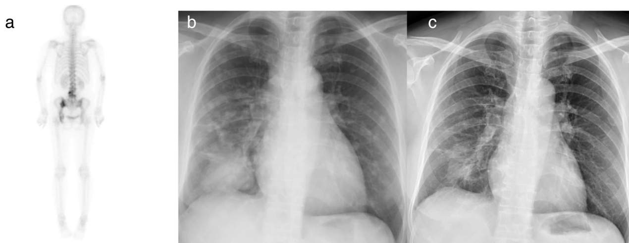
FIGURE 2 Findings of bone scan and chest radiography performed before and after administration of combination therapy. (a) Bone scan findings showed metastases at the lumbar spine. (b) A huge mass in the right lower lung (RLL) with lung-to-lung metastasis was observed on chest radiograph. (c) Chest radiograph revealed the RLL mass and bilateral lung nodules had significantly decreased in size

stage IVb lung adenocarcinoma with spine metastasis and L858R point mutation in exon 21. Dacomitinib (30 mg daily) plus bevacizumab (7.5 mg/kg, every 3 weeks) was administered as the first-line therapy. Follow-up chest radiography performed after 2 months showed a significantly decreased primary tumor size. There were also no obvious adverse effects, except self-limited mild epistaxis and skin peeling on the feet.