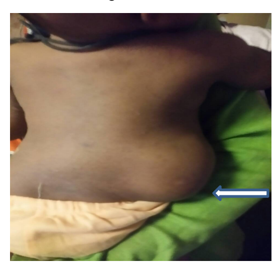
Figure 1 : Mass of 6cm x 10cm occupying the right flank

A 6-month old female infant was presented with a swelling in the right lumbar region, which was noticed by the parents at birth. The swelling was initially small but gradually increased to attain the current size which became more prominent up on crying and decreased while in supine position. On examination, there was a globular painless swelling, 6cm x10cmin size, which was soft and reducible below the right costal margin lateral to the dorso-lumbar spine. Bowel sound was heard over the mass (Figure 1). X-ray of the chest showed absent ribs (T10, T11) on the right side with hemi-vertebrae. There was also scoliosis with convexity to the left and overcrowding of the ribs on the right chest on the chest X-ray (Figure 2). Ultrasound of the abdomen showed hernial defect in the right lumbar region measuring 4.5cm x 2.9cm, containing bowel loops and right ectopic kidney, which was visible on the right hypogastric area in other words fused kidney on the right side. CT scan also showed crossed fused kidney (ectopic kidney) on the same side with the hernia sac, containing bowel and the right lobe of the liver. It also showed absentribs (T10, T11) with right hemivertebrae of the corresponding vertebral bodies on the same side (Figure 3). Renal function tests showed normal values creatinine-0.4mg/dl and BUN-16.1mg/dl.