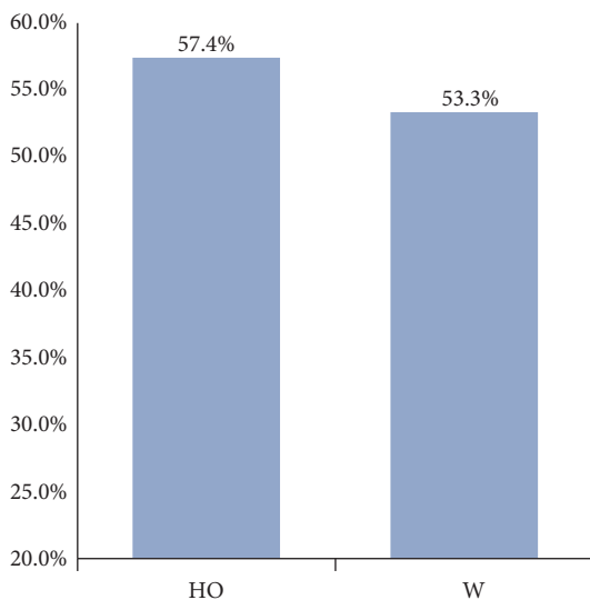
FIGURE 3: Comparison between prevalences of non-falciparum infection regarding social class.