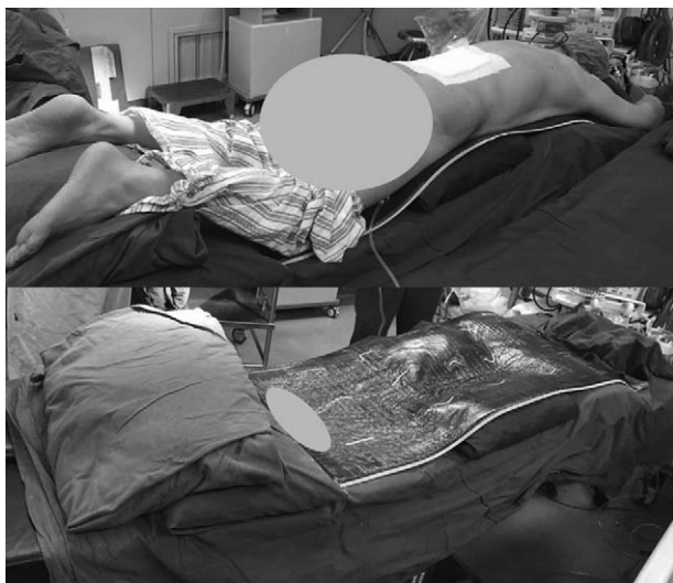
Figure 1. View of a patient positioned prone in a standard manner and the operating table. Two chest pads and 2 iliac pads were placed to allow the abdomen to hang free. The knees and shins were also placed on pads. The operating table was adjusted to make the hip and the knees in slight flexion.

The parameters in Table 1 were measured using the Picture Archiving and Communication System (PACS system, GE) and surgimap spine (Nemaris). We measured LL and Cobb angle on preoperative standard anteroposterior and lateral radiographs (standing position, with full extension of hips and knees, elbow flexion and hands on the clavicle, including bilateral femoral heads). Preoperative MRI was also available, through which LL measured on MRI in supine position (MRLL) and Cobb's angle measured on MRI in supine position (MRCobb) were obtained. The 20 patients investigated were positioned in a standard manner on an operating table. The operating tables were of the same type; 2 chest pads and 2 iliac pads were placed to allow the abdomen to hang free. The knees and shins were also placed on pads of the same height. The operating table was adjusted to