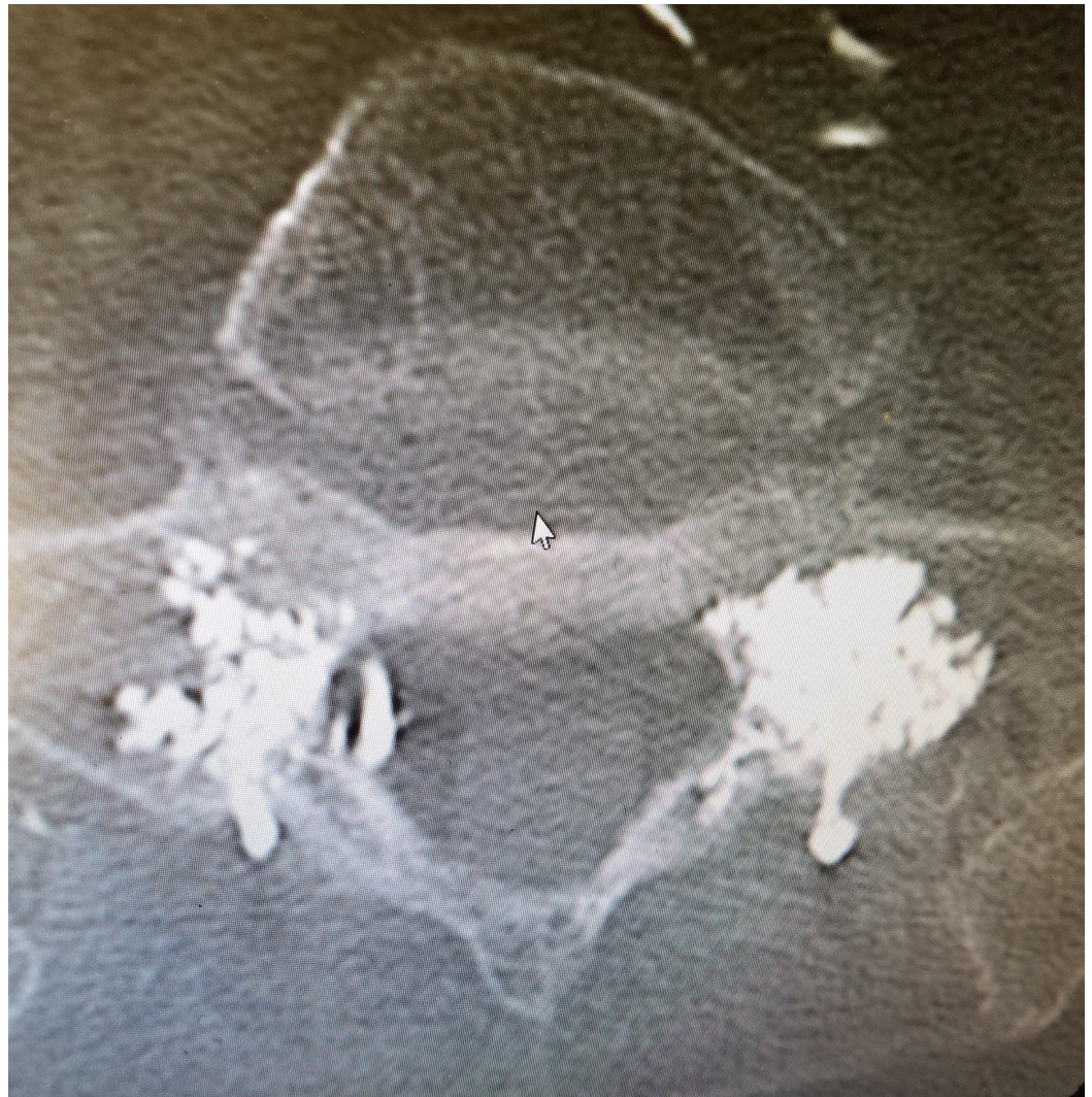
FIGURE 1: Postoperative axial CT of sacral alae obtained after bilateral sacroplasty demonstrating anteromedial spread of Cortoss filling in associated fracture sites.

The sacrum is a large solid bone and the downward load from the lumbar spine is spread laterally to both alae that are more osteoporotic. Although the sacral alae are weight bearing, the cortex appears to remain intact in non-traumatic osteoporotic insufficiency fractures, as the cortex is thicker and more compact than the lumbar vertebral body [21]. This allows patients to be symptomatic without the classical signs of clear bony collapse or fracture lines as seen in VCFs.