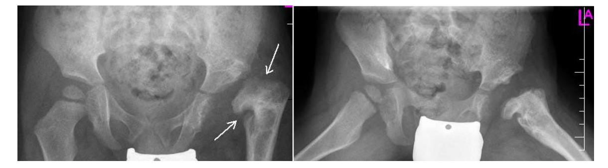
Figure 3. Radiographs: AP and Lauensteun with postrezidual deformity in the same patient after 2 years.