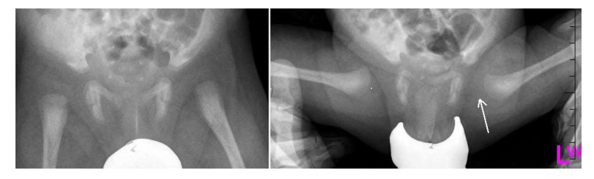
Figure 2. Radiographs: Antero-posterior (AP) and Lauensteun view of three weeks old child's left hip, slightly out of the socket (eccentric hip).